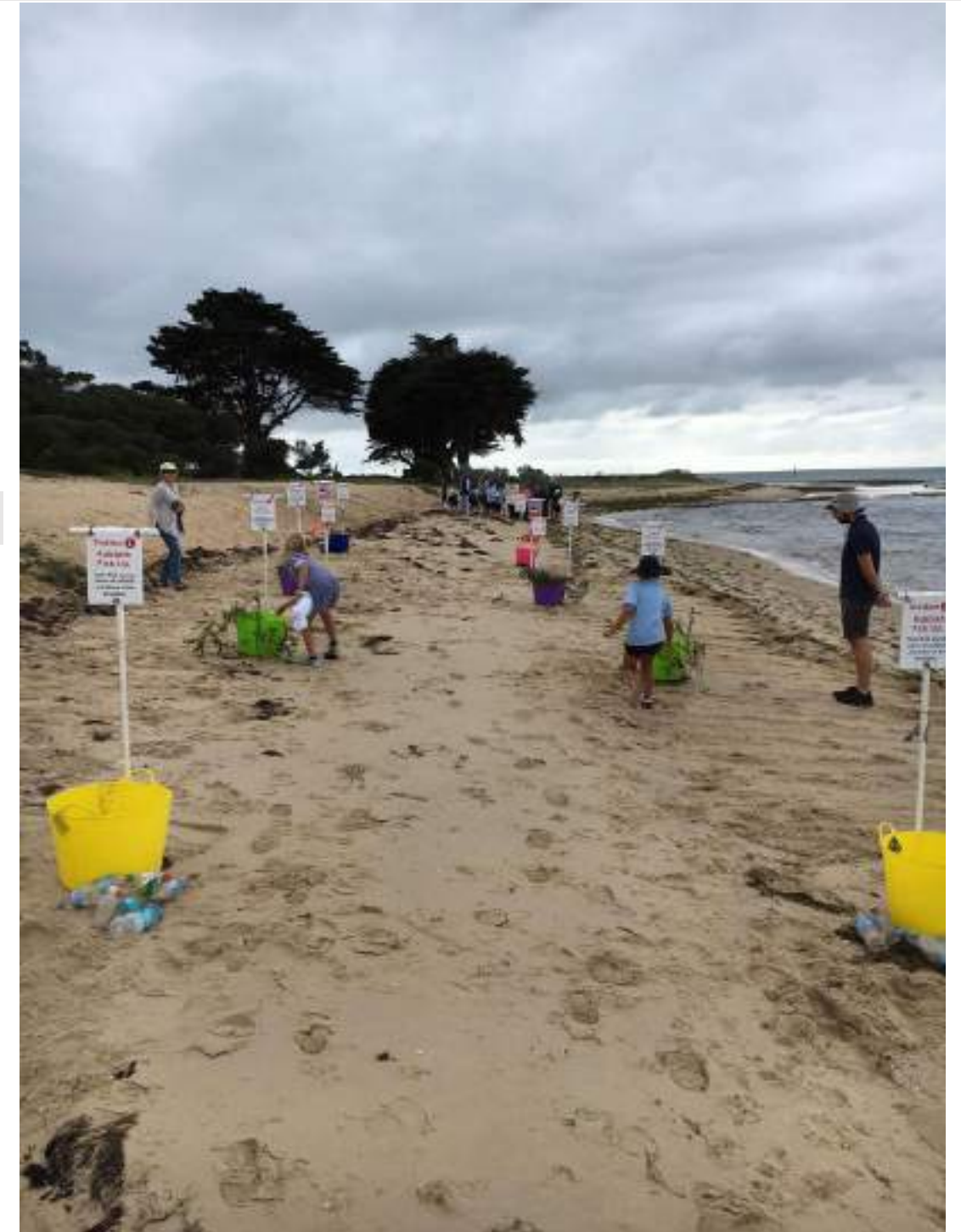
St Leonards PS Students undertaking the Coastcare Challenge Course