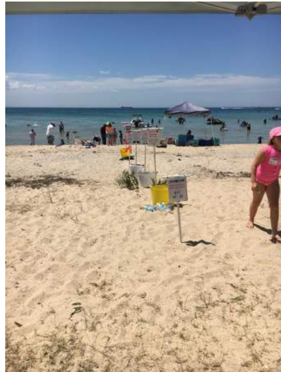
A young participant navigates the Coastcare Challenge Game