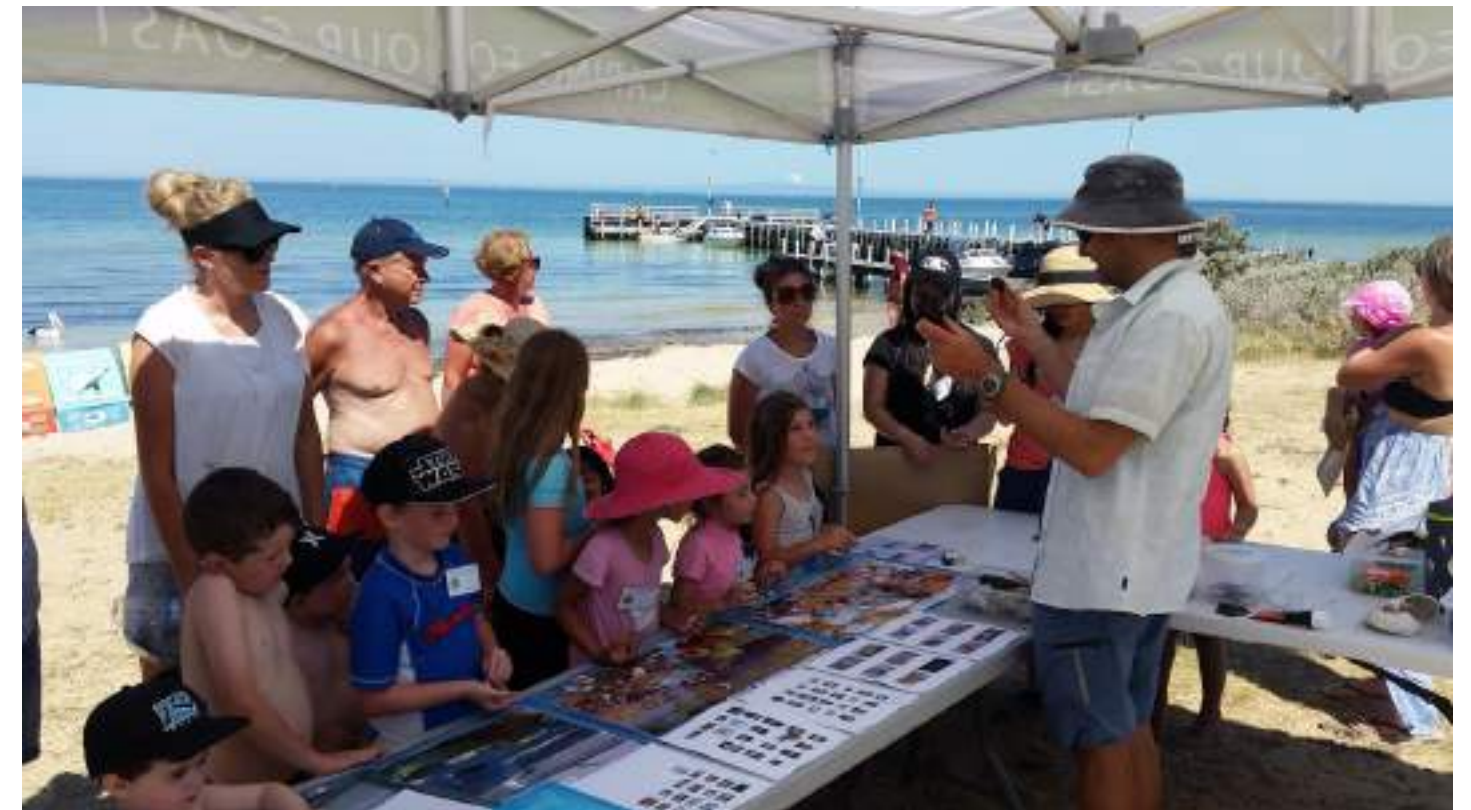
Summer By The Sea Participants at Indented Head and St Leonards Boat Ramp