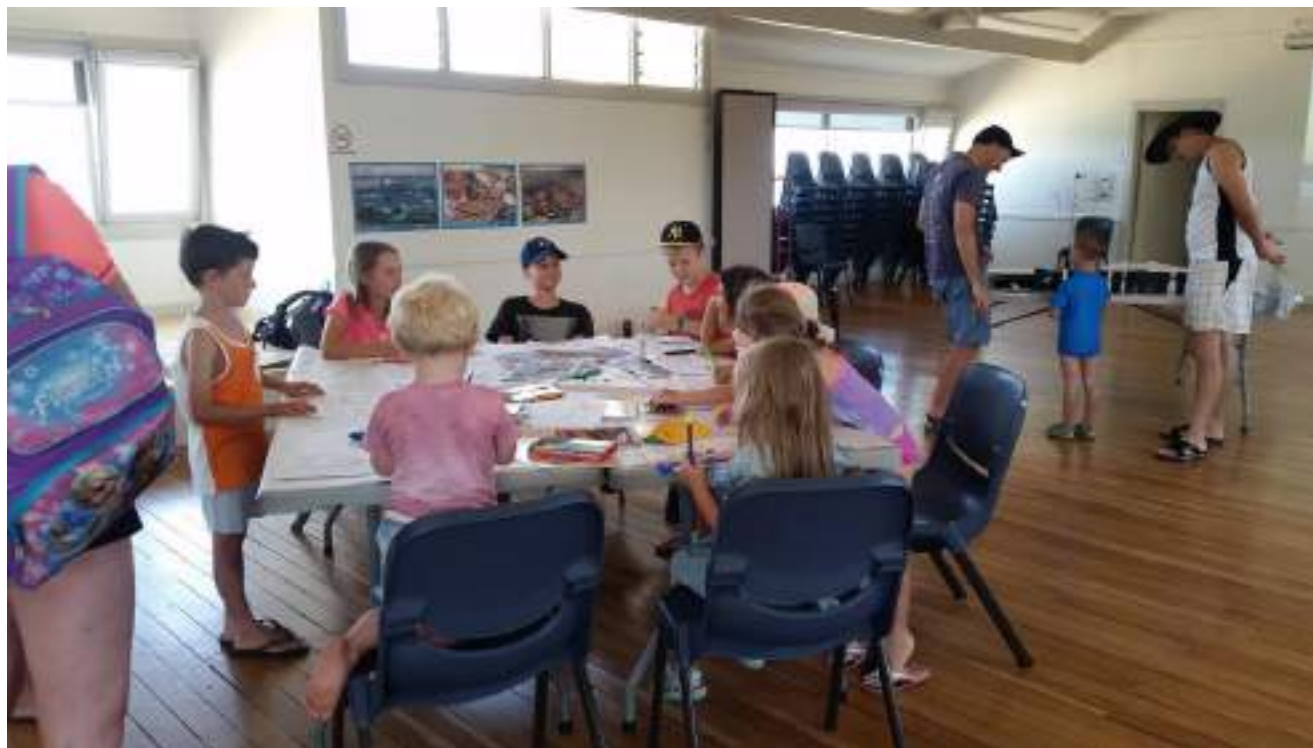
Left to Right: Environment Craft Activities ID Table, Be A Hero Colouring in